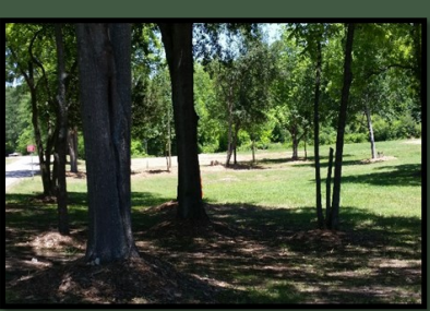
Demolition: Block Houses: Ninth Street Before and After